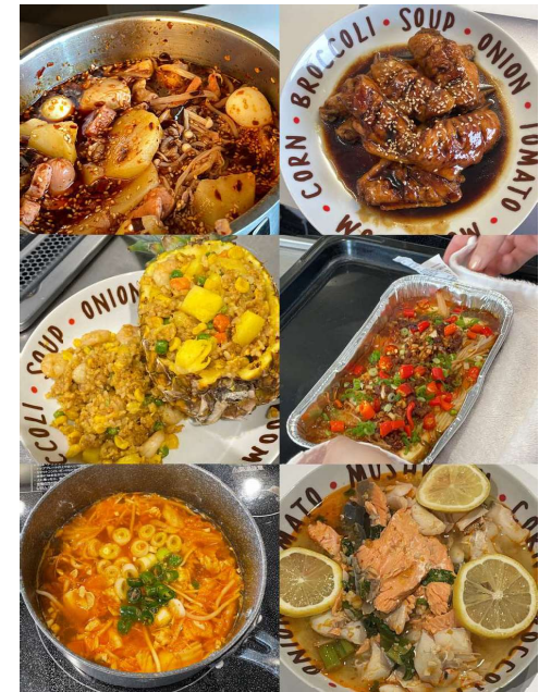
cooking (I like spicy food!!)